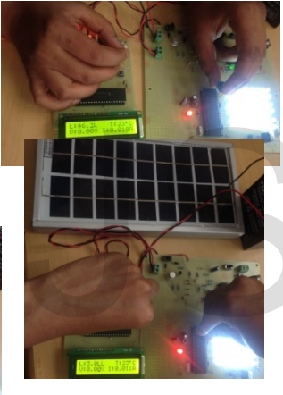
5 Future Scenario